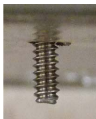
Door Check Stud

5. Cut off door check stud, located inside top right of cabinet. (If equipped).