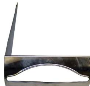
Towel Tray and Guide