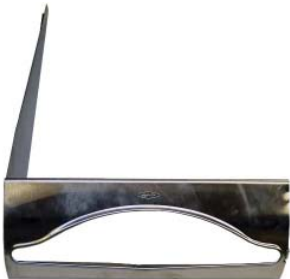
Towel Tray and Guide