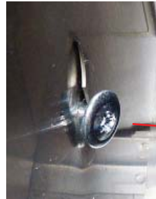
Side Towards Bottom Screws at an Angle